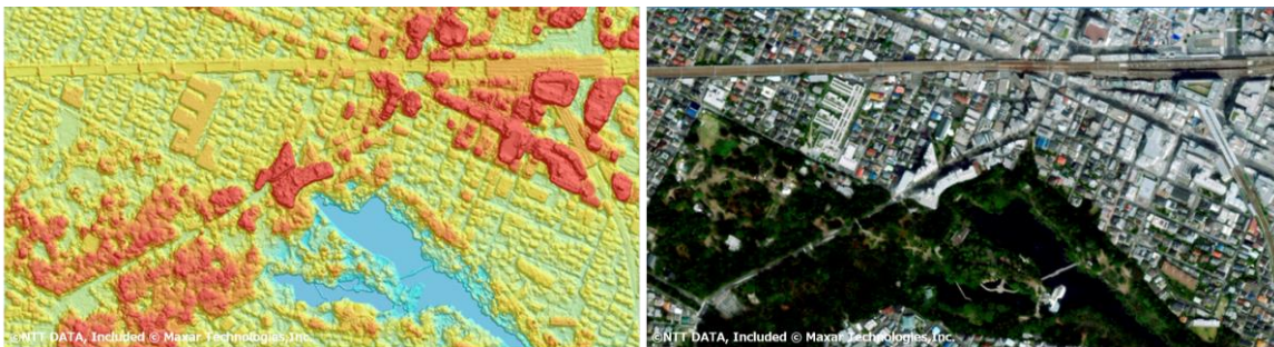
Inokashira Park near Ghibli Museum in Tokyo (Left:0.5m DSM/ Right: Orthorectified imagery)

Applying a new algorithm that allows a better representation of building shapes, including roofs, enables better simulation (e.g. flood, flight, etc.) against the current version.